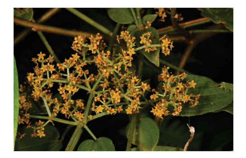
Figure 1. Rubia cordifolia

and this herb is majorly known for these phytochemical constituents. (17) Each of its phytochemical is associated with significant therapeutic properties like antiinflammation, anti-cancer, anti-bacterial, anti-viral, hepatoprotective, protective, nephroprotective, anti-oxidant, analgesic, acne etc. Rubia cordifolia has great wound healing potential. (18,19) Apart from its therapeutic properties, this medicinal herb is also used as a food color and has been used a natural dye since ancient times. (20) Taxonomy vernacular names of Manjishtha are given in table no.1 and 2 respectively.