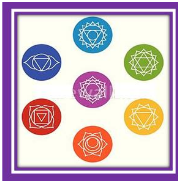
Figure 2. Various types of Yoga Chakra