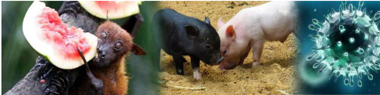
Transmission of Nipah virus

common way to get the disease. Human-to-human transmission occurs during close contact between family members and/or medical caregivers.